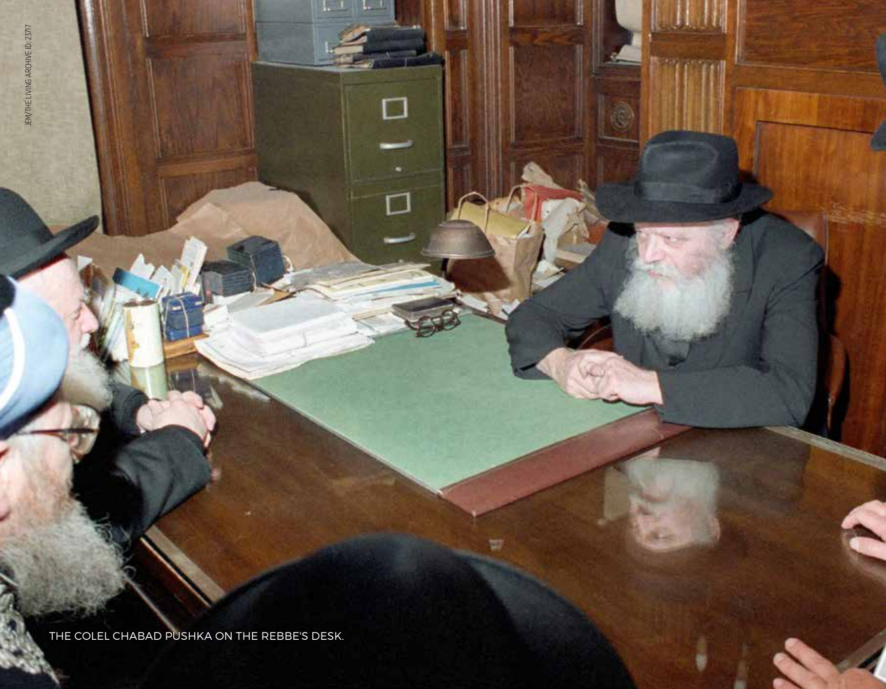
THE COLEL CHABAD PUSHKA ON THE REBBE'S DESK.